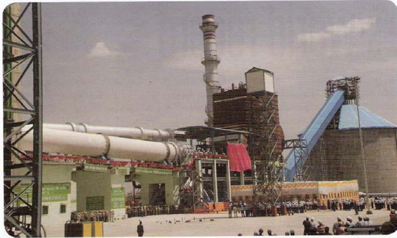
Celebrations at Shree Cement's new clinker manufacturing unit (Line VII) at Bangur City, Ras in Pali district of Rajasthan